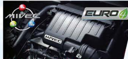
EURO-4 Compliant 1.2L DOHC 12-Valve MIVEC (3A92) Engine MIVEC adjusts the timing of the intake camshafts for optimal performance across the RPM range.

With an impressive combination of the 1.2L DOHC 12-Valve Mitsubishi Innovative Valve-timing Electronic Control (MIVEC) system engine, lightweight and aerodynamic body, the Mirage G4 is able to achieve an impressive mileage of up to 21 km/L.