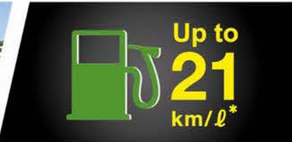
STANDOUT MILEAGE *Mitsubishi Motors Corporation Test results using EU combined cycle