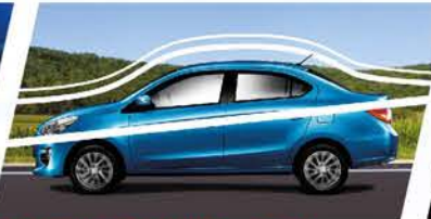
AERODYNAMIC DESIGN (C d = 0.29) The Mirage G4's low drag coefficient results in better performance and fuel economy.