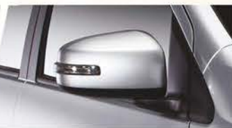
Power Side View Mirrors with Integrated LED Turn Signals (GLS)