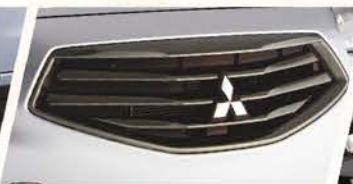
Dark Chrome Diamond Cut Front Grille (GLS)