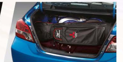
Impressive Trunk Space