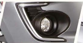
Fog Lamps (GLS)