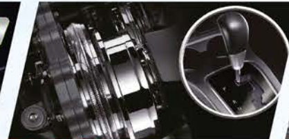
INVECS - III CVT INVECS-III CVT automatically selects the optimal gear ratio based on road & driving conditions. It maximizes engine power and RPM for excellent fuel economy while still providing a smooth and agile driving feel throughout the rev range.