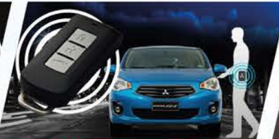
KEYLESS OPERATION SYSTEM (GLS) The Keyless Operation System (KOS) lets you get in and out of your Mirage G4 simply by carrying the key with you. Quickly start up your car by pressing the Start/Stop button with the key fob nearby.