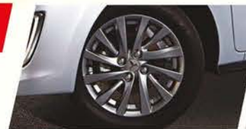
Dark Chrome 15-inch Alloy Wheels (GLS)

Celebrate the good life with the Mitsubishi Mirage G4 - the perfect vehicle designed to complement all the wonderful things happening to you. It's loaded with the features that suit you perfectly - fuel efficiency and eco-friendliness combined with uncompromised power, roomy cabin and spacious trunk that ensure an unforgettable driving experience. It's everything you need from a small sedan.