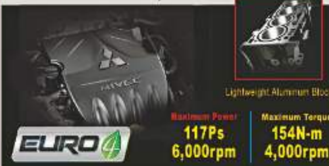
Lightweight Aluminum Block