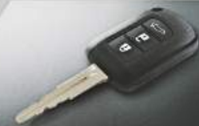
Keyless Entry with alarm and immobilizer

With its sleek and smart design, the Mitsubishi Lancer EX GLS was created to turn heads and always take center stage wherever it goes.