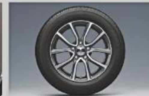
16-inch 2-tone alloy wheels with 205/60 R16 tires