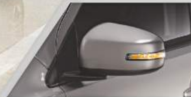
Power side mirrors with turn signal light