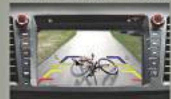
Reverse Camera Display (Dealer Option)

The Lancer EX's advanced Multimedia Entertainment System has a variety of multimedia playback options including playing your favorite DVD or music directly from an iPod, Auxiliary jack, or USB flash drive, and connecting to your Bluetooth-capable handheld device. Its 8-inch touchscreen also acts as the GPS navigation (Dealer Option) and reverse camera (Dealer Option) display.