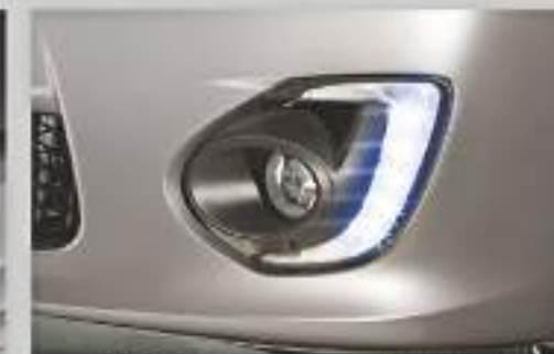
LED Daytime Running Lights (DRL) and front fog lamps