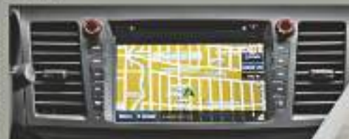
GPS Navigation (Dealer Option)