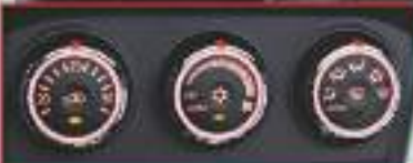
Automatic Climate Control System (dial-type)

Ergonomically laid out cockpit putting every control exactly where intuition tells it should be.