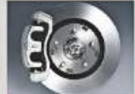
4-Wheel Disc Brakes

The Mitsubishi innovative Valve timing Electronic Control (MIVEC) is an exclusive technology that adjusts the timing of the intake camshaft for optimal performance across the rev range. At low ranges, MIVEC provides on-demand acceleration for quicker starts, while higher ranges receive an impressive boost of power.