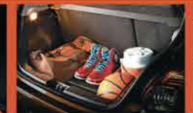
Flexible Cargo Space with Lamp and Tonneau Cover Rear bench-type seats with foldable seatback for GLX