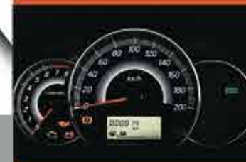
White-lit Semi-high Contrast Meter Cluster (GLS) with Eco Assist Lamp