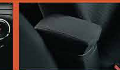
Floor Center Console Box and Armrest (GLS Dealer Option)