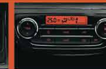
Automatic Climate Control System (GLS)