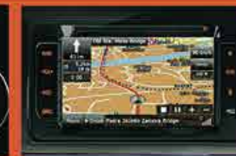
Multimedia Entertainment System with GPS Navigation (GLS Dealer Option)